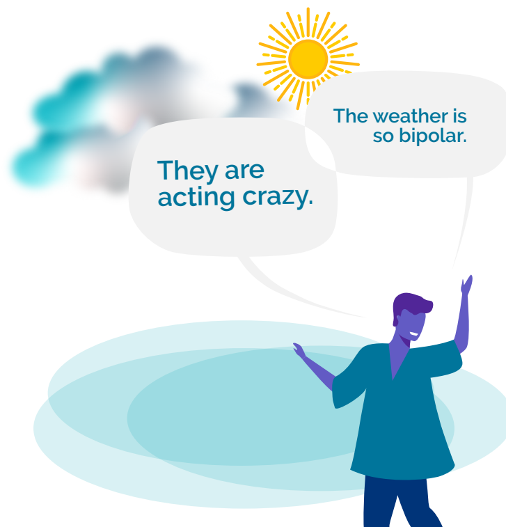
Mental Health Microaggressions